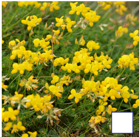
Bird's-foot-trefoil ( Lotus spp. )

Did you see any of the following vegetation? Tick all that apply.