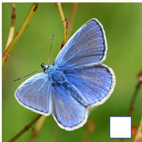
Common blue butterfly ( Polyommatus icarus )

Forewings are mainly dark brown and orange, with an intricate grey and black pattern on the hind wings.