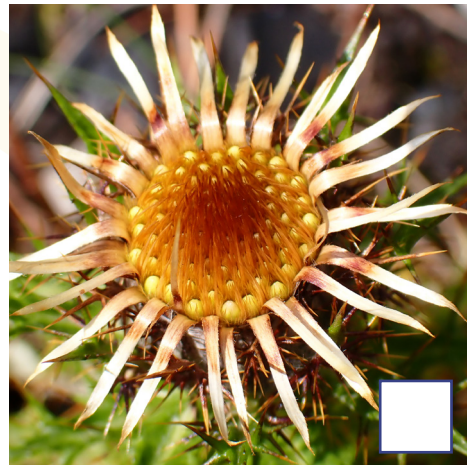
Carline thistle ( Carlina vulgaris )

A bushy, dwarf shrub with stems packed with tiny green leaves and pink/purple coloured flowers.