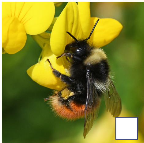
Bilberry bumblebee ( Bombus monticola )

Did you see any of the following invertebrates? Tick all that apply.