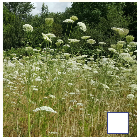
Yellow / white umbellifers (Apiaceae)

Dandelion-like perennials with dense, round yellow flower heads. Examples include Coltsfoot, Cat's-ear, Mouse-ear hawkweed, Hawk's-beards and Hawkbits.