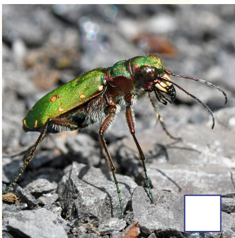
Green tiger beetle ( Cicindela campestris )

Males are conspicuous with their violet-blue wings, finely edged with clear, white wing markings.