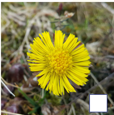
Yellow composites (Asteraceae)

A purple-pink orchid with leaves that are generally un-marked. Identification can be difficult due to hybridisation with Common spotted-orchid.