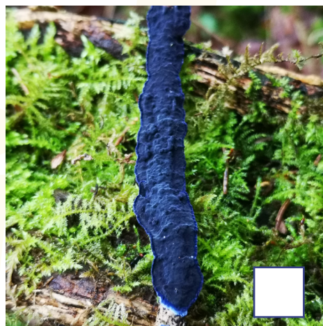
Cobalt crust fungus ( Terana caerulea )

A variable grassland fungus with moist, sharply conical caps that soon turn black all over, usually from the centre of the cap. They can remain standing for many weeks.