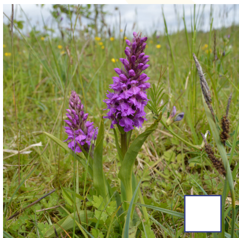
Southern-marsh orchid ( Dactylorhiza praetermissa )

A spiny biennial plant with distinctive brown and golden flower heads that look like a thistle that's gone to seed.