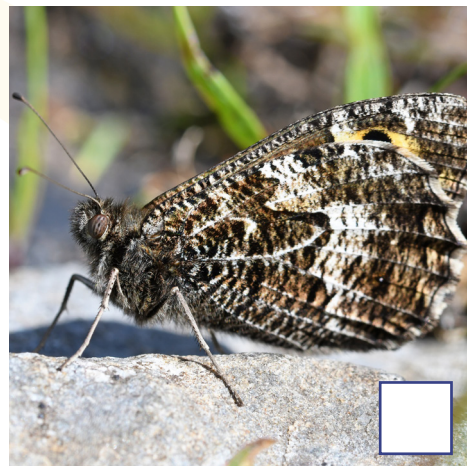
Grayling butterfly ( Hipparchia semele )

Small and moth-like. Grey-brown wings with mottled brown markings and two rows of small white spots.