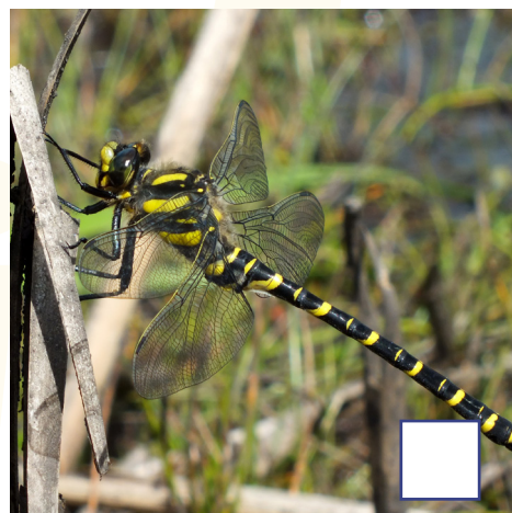
Golden-ringed dragonfly ( Cordulegaster boltonii )

Large, metallic-green beetle with purple-bronze legs and eyes, and creamy spots on the wing cases.