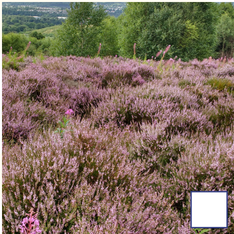
Ling heather ( Calluna vulgaris )

A low-creeping, perennial plant with clusters of deep, yellow flowers tinged with orange/red.