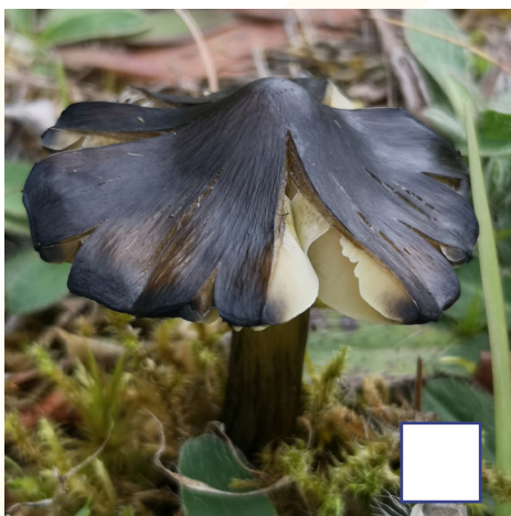
Blackening waxcap fungus ( Hygrocybe conica )

A classic fairy tale toadstool, it has a red cap with white wart-like spots and white gills. It is often found beneath birch trees in autumn.