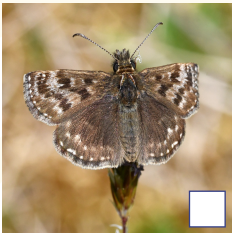
Dingy skipper butterfly ( Erynnis tages )

Over half of the abdomen orange/red and there are also two lemon yellow bands on the thorax.