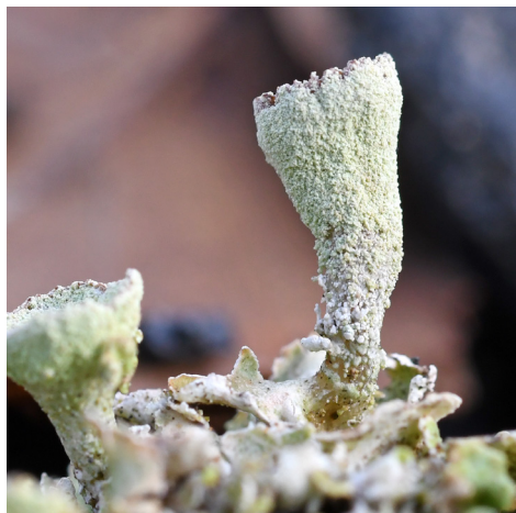
Cladonia Lichens ( Cladonia spp.)

Did you see any of the following? Tick all that apply.