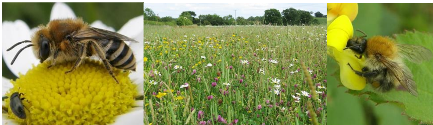
Wildflower meadows provide food for pollinators such as solitary bees and the Common carder bee

Further information on these themes along with some suggested actions are given on the following pages.