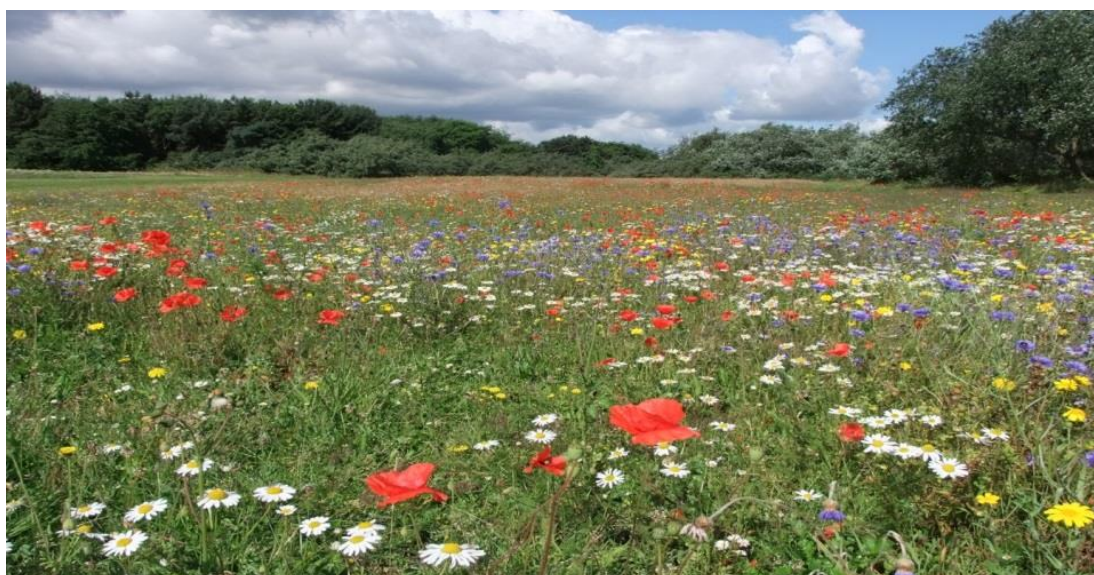
Annual wildflowers providing a nurse crop for a perennial meadow at Grangepans meadow, Bo'ness

The Parliamentary Office of Science and Technology point out that “Investment in green infrastructure has a greater positive effect in economically deprived areas than affluent areas. Economically deprived communities spend more time in their neighbourhoods, and the quality of these green spaces has a larger impact on their health and wellbeing”.