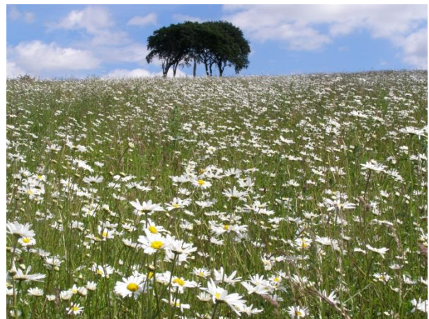
Wildflower-rich grassland creation and restoration at Copt Hill, Houghton-le-Spring, Sunderland