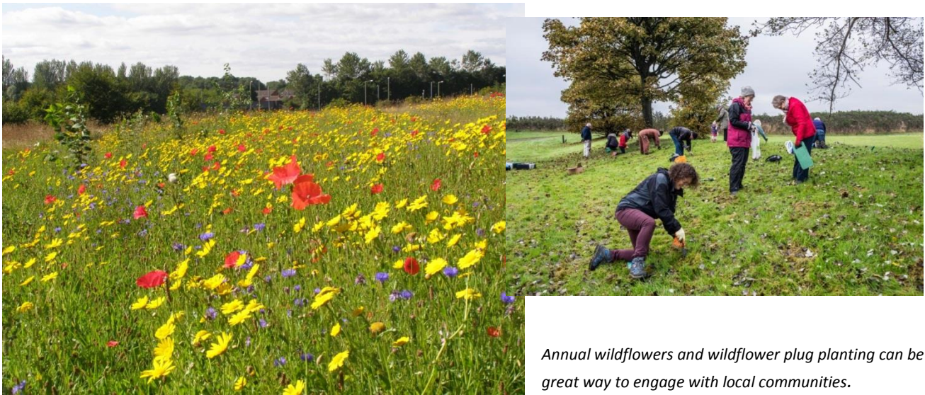
Annual wildflowers and wildflower plug planting can be a great way to engage with local communities.

For pollinator conservation to be successful we need to let people know how important pollinators are. There are many ways to raise public or business awareness such as mailings, events, flower/meadow creation, garden-pollinator awards etc. Businesses may also be persuaded to sponsor local pollinator work.