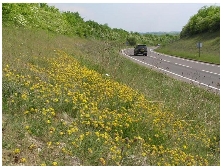
Sympathetic management of roadside verges can provide increased food and nesting opportunities for pollinators and other wildlife