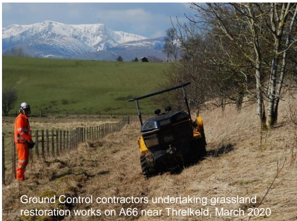
Ground Control contractors undertaking grassland restoration works on A66 near Threlkeld, March 2020

Using innovative techniques and specialist machinery, we've worked closely with Highways England and contractors Ground Control to create a range of habitat for pollinators on parts of the A595/A66 Strategic Road Network. We've added over 200 native nectar and pollen rich trees, planted over 50,000 wildflower plugs, and sown over 90kg of wildflower rich seed to create or enhance species-rich grassland, sunny banks and glades, tussocky areas, and flowering lawns.