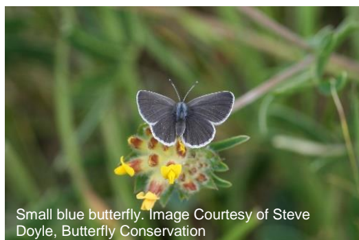
Small blue butterfly.

Ongoing sensitive management is now in place, along with yearly surveying and monitoring, to ensure that each site thrives. Recognised for its importance and pioneering approach, Get Cumbria Buzzing! is a finalist in the Highways England 'Excellence in the Environment' Awards 2020.