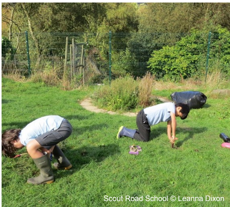
Scout Road School

New primary schools resources, available to download, will help schools to develop their grounds for pollinators and to teach about pollination throughout the curriculum.