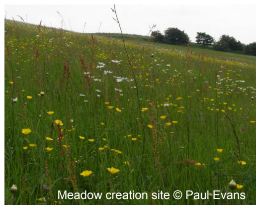
Meadow creation site

With support from the Co-operative Group, B-Lines are now extending into Cumbria, Lancashire and Greater Manchester. The new 'Coast to Coast Bee Roads Project' is working with Local Nature Partnerships and Local Records Centres to identify B-Lines networks in the north west.