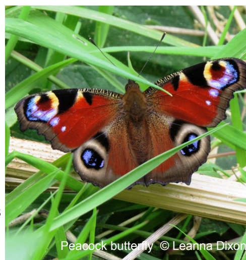
Peacock butterfly

This newsletter aims to give you a flavour of the current B-Lines work and hopefully encourage you to get involved in developing the B-Lines in your area.