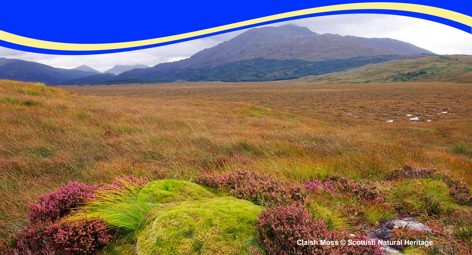
Claish Moss